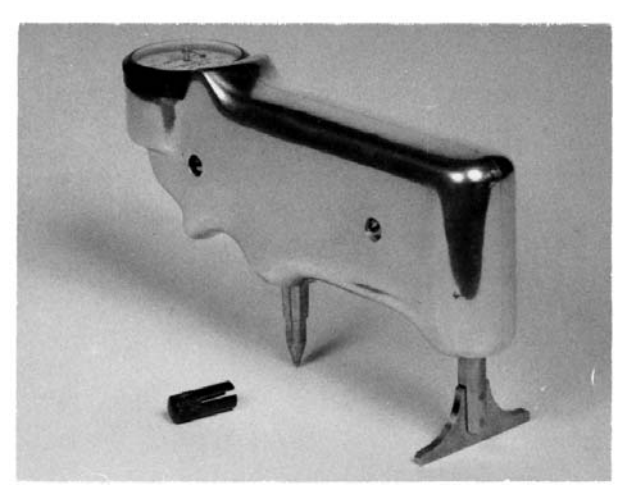
FIG. 1 Barcol Impressor, Model 934-1

3.1 Definitions —The definitions of terms relating to hardness testing appearing in Terminology E6 shall be considered as applying to the terms used in this test method.